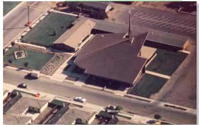
AERIAL VIEW, CIRCA 1965

ALSO IN THE 60's — Bethel Bible Series began; Women's Bible Study Circles were formed.