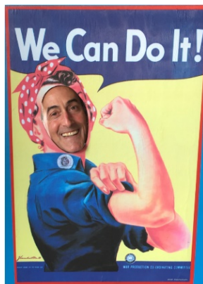
Rosie the Riveter

2018 – 10 activities and (205 total attendees): 1/14 - Escape the Room – 11, 3/17 – Annual St. Paddy’s Day Brewery – 28, 4/28 – Rosie the Riveter – 25, 7/7 – Elkhorn Slough Kayak / Berry Picking – 25, 8/25 – San Jose Brewery Crawl – 22, 9/22 – Santa Cruz Diner / Boardwalk – 15, 10/6 – Fleet Week / Walk the Golden Gate Bridge – 27, 11/3 – Golden Gate Park Segway / Picnic – 15, 1/15 – Kings Brass @ Mt. Herman – 15.