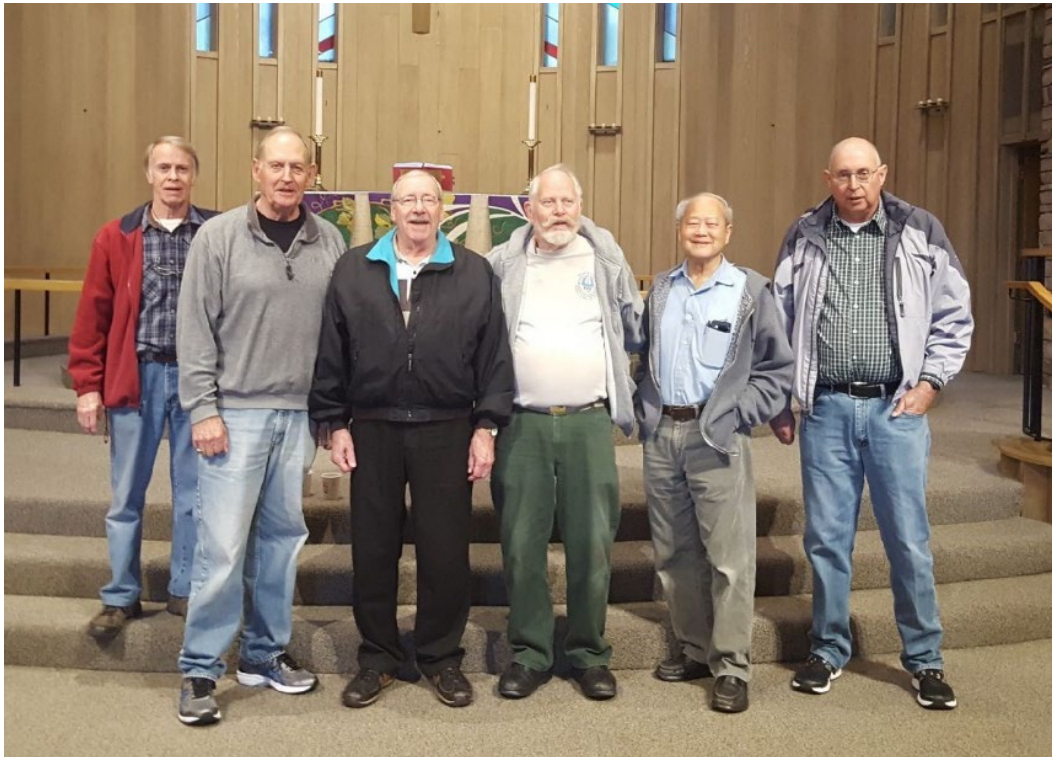
Our indomitable crew from Men of Monday