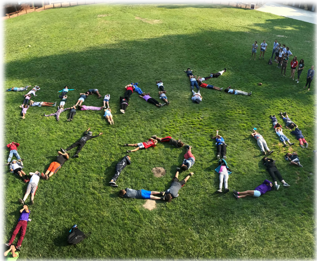
This photograph is the thank you from the summer campers that we helped via Help One Child. Bethel purchased swim suit / towel / PJs in order for the kids to have a fun and warm camp experience.