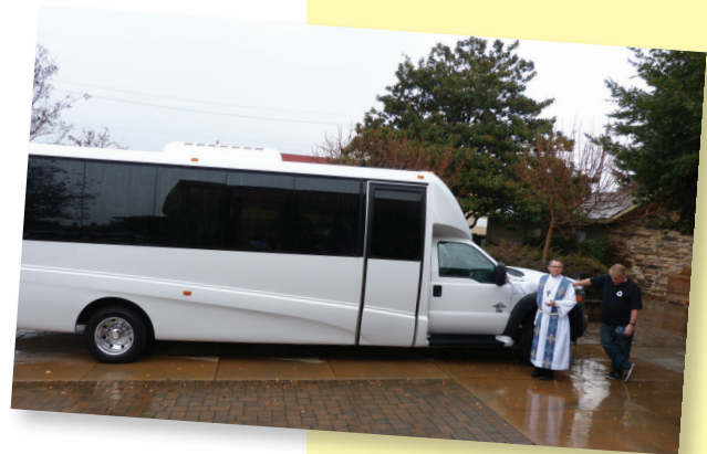
Blessing of the new Bethel Bus