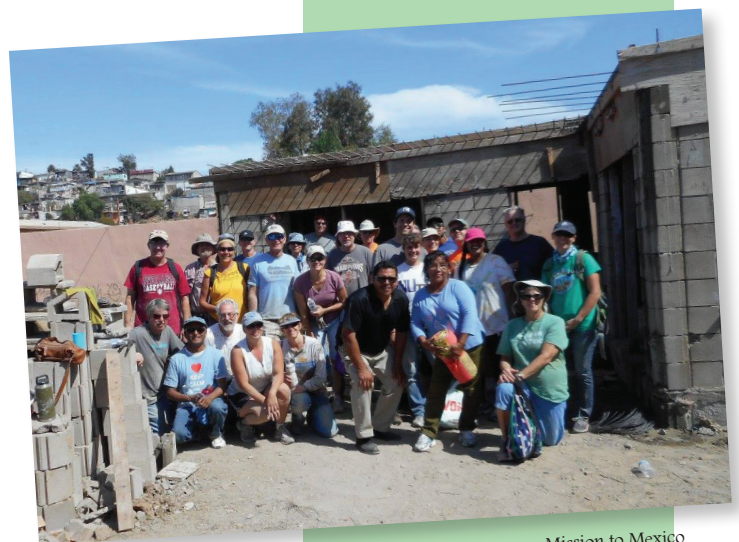
Mission to Mexico